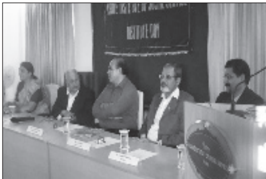
'Institute Day' – (Inaugural Function) Guest Managing Committee Members & Director