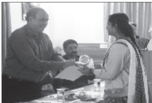
'Prize Distribution Function'