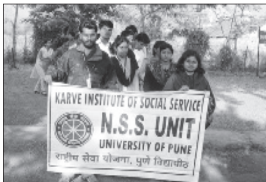
'Students rally for awareness at the village