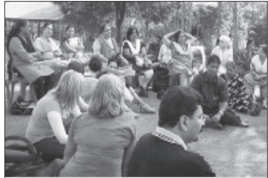
QUB-KInSS staff relaxing at the end of the Picnic