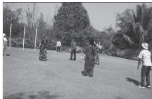
QUB-KInSS staff Playing Cricket