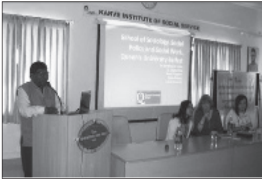
Introduction of QUB-KInSS Programme