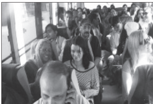
QUB and KInSS staff travelling for Picnic

In January 2011 a staff picnic was organised. All teaching, Non teaching & R & C Cell Project Staff and the guests from Queen's University, Belfast, UK went together at Lakewood Farm House, Pune. This event helped for healthy interactions between all and was totally refreshing. This was fully sponsored by our Management under the Staff Development Programme. We heartily thank the Management Committee and hope for such endeavours in future.